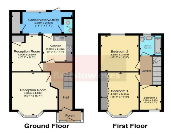
Total floor area 105.6 m² (1,136 sq.ft.) approx