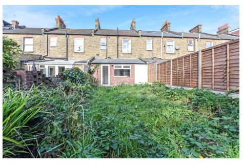
Matlock Road, Leyton £650,000 - £700,000